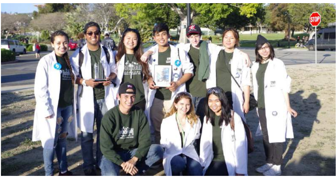
The 'Dox proudly display their Excellence in Engineering award. Top: The Robodox, our mentors, and our coaches. Bottom: The seniors of the team.