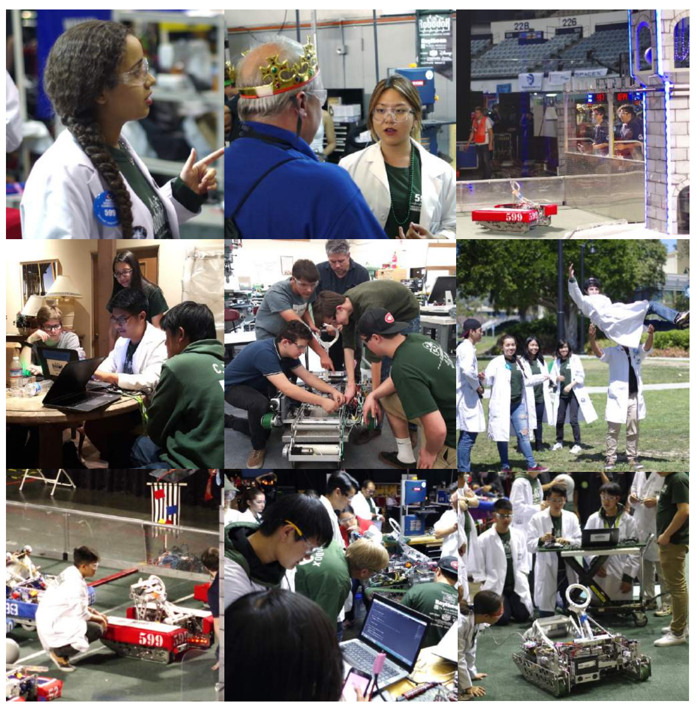
UPCOMING EVENTS Balboa Engineering Workshop (April 4) · VEX Kickoff (April 25) · Robodox Banquet (May 20)