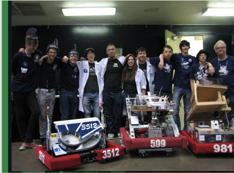
The Dox chilling with all the other great teams! Above : Our Alliance! Below : Mascots all the way!

March 21st the Robodox traveled to the Long Beach First Robotics Competition Regional. The team came more prepared and more experienced after a hard fought regional two weeks before. The Medic also arrived at the competition with an improved loading mechanism, and immediately passed inspection. Throughout the competition the Robot First Aid station was busy at work providing assistance to teams with manpower and parts. Yay Gracious Professionalism! Once again, the Dox showed dominance in the Full Court shot throughout the competition, ranking high for most of the qualifying matches. Although one of the most formidable robots at the competition, the Dox lost in the finals during the elimination rounds. It was a hard fought competition, but they made it to the finals for the first time since 2006. The Robodox came home with silver medals around their necks. WHO ROX?